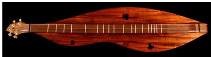
Courting.....Hourdrop or Aorelle