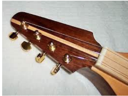
Scroll Head with wooden pegs..... Guitar Head w/ geared tuners