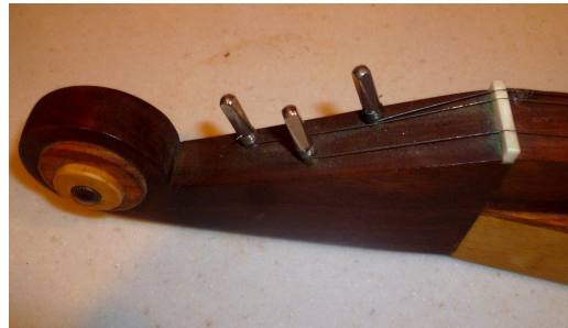
Solid Block Head (shaped like a scroll) with Autoharp Tuning Pins