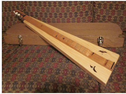
Violin or Fiddle Sided .....Trapezoid